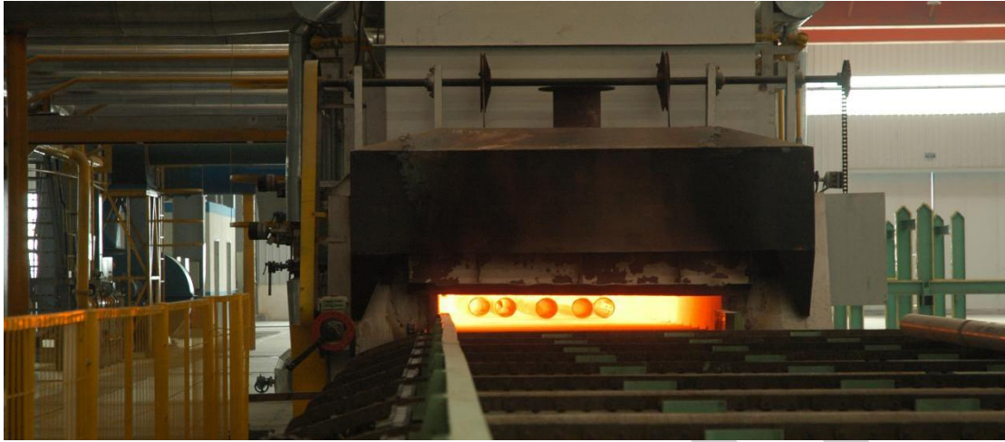
Tempering Furnace (回火炉)