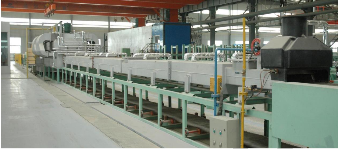
Pickling And Passivation Equipment (酸洗钝化设备)