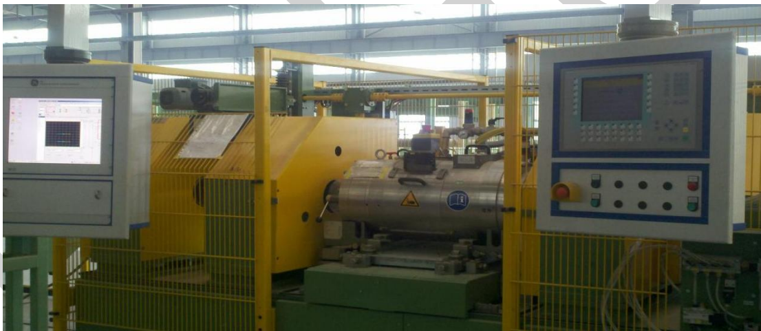
超声、涡流联合探伤测厚设备 (Ultrasonic and eddy current combined flaw detection and thickness measurement equipment)