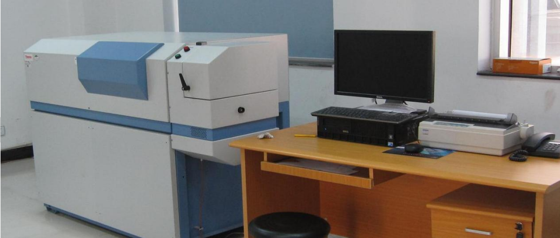
Metal analyzer 金属分析仪（电镜检测）