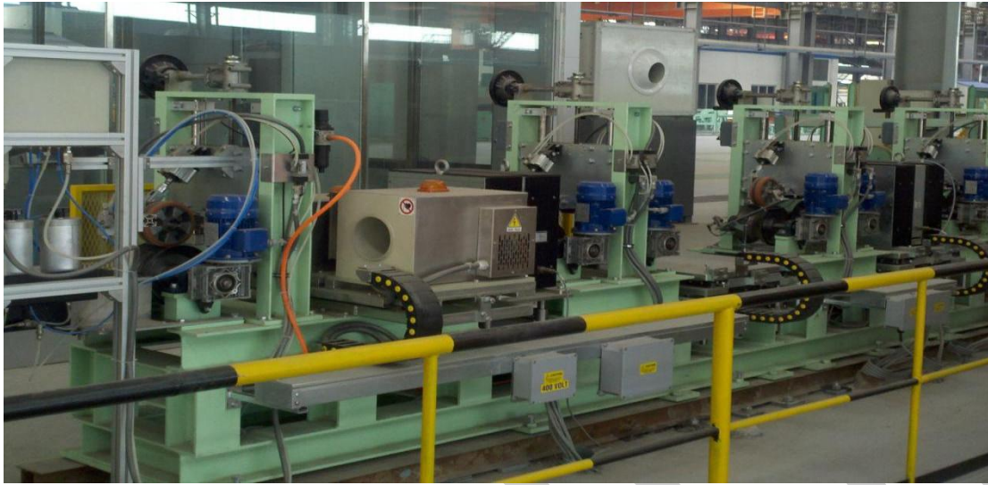
德国 KK 在线超声探伤测厚机 (Online ultrasonic flaw detection and thickness measurement machine)