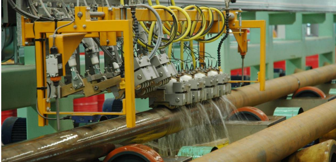
磁粉探伤设备(Magnetic particle flaw detection equipment)