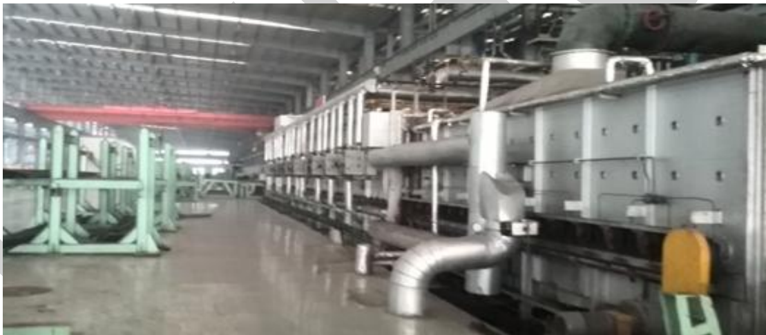
Solid Solution Treatment (固溶处理)